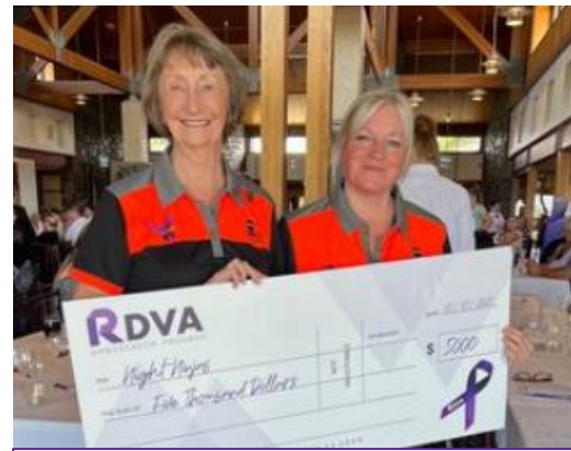
A donation for Night Ninjas