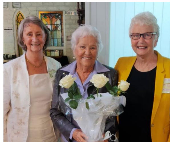
Forum's 80th birthday party