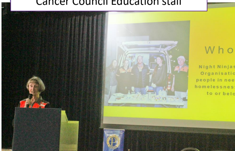
Night Ninjas presentation at a Probus group