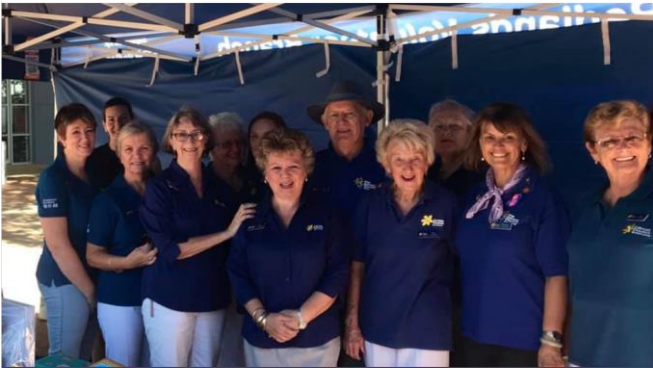
Cancer Council Education stall